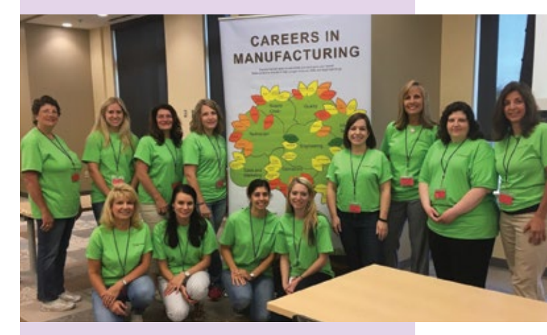
Cooper Standard host STEM Summer Camp for HAVEN kids