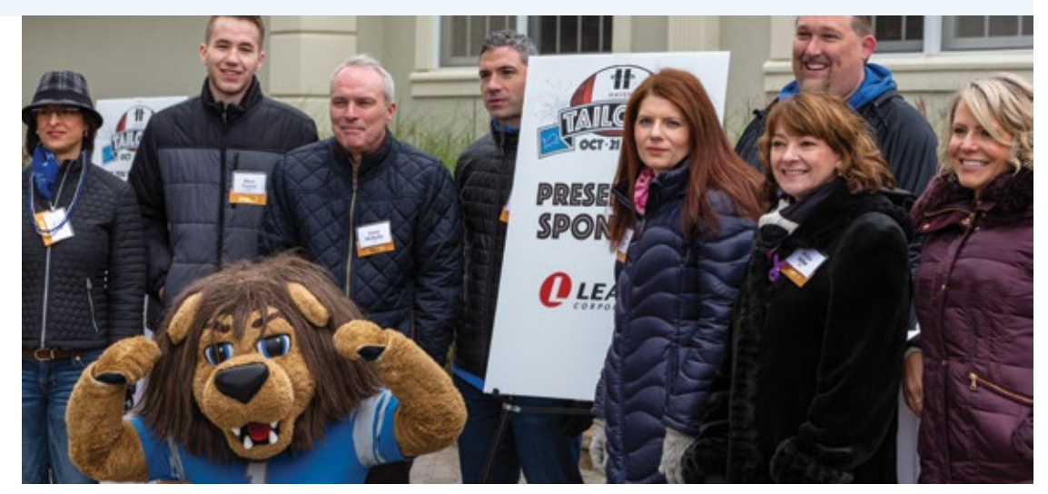
LEAR, HAVEN's Presenting Sponsor at 2017 Tailgate

"HAVEN is so much more and means so much to me! It is a safe place to get help and be understood when the world around us doesn't understand what we have been through. They have helped me so much to walk through the healing process and helped me to stay safe. Thank you for everything!"