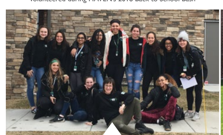
Prevention Education SPARK Program field trip