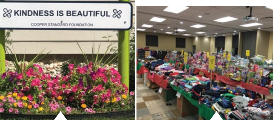
HAVEN's Holiday Gift Giveaway served 252 adults and 556 children