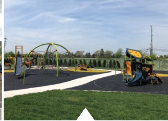
HAVEN's completed playground